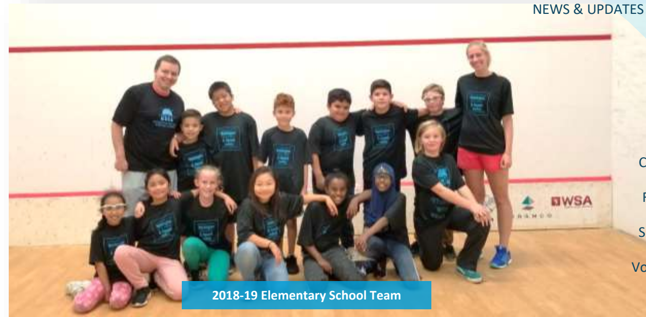
2018-19 Elementary School Team