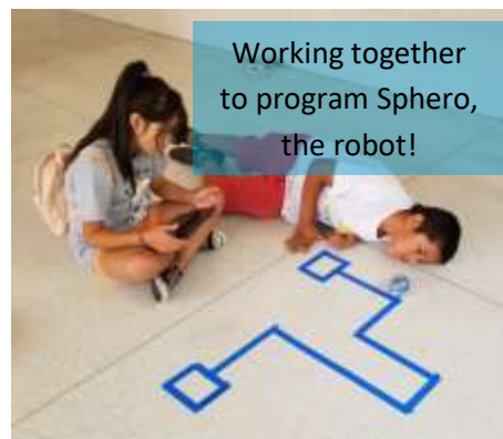
Working together to program Sphero, the robot!

were able to explore and discover with Scratch because of our Chromebooks & Cases Campaign which allowed us to purchase Chromebooks for use during tutoring. This initiative was funded by donors from across the west, with particular support from alumni of Vassar College. Additional support from across the country enabled us to bring our students to iFly Indoor Skydiving and learn about and experience the physics of skydiving firsthand.