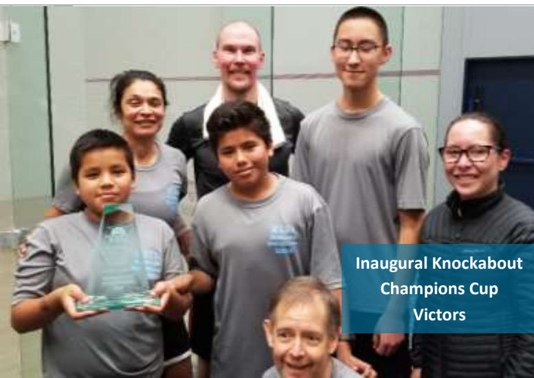
Inaugural Knockabout Champions Cup Victors