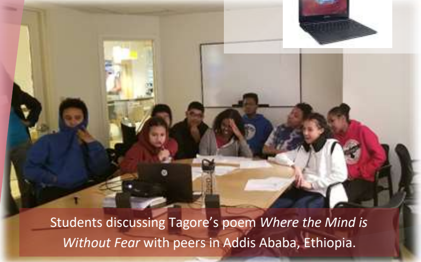
Students discussing Tagore's poem Where the Mind is Without Fear with peers in Addis Ababa, Ethiopia.