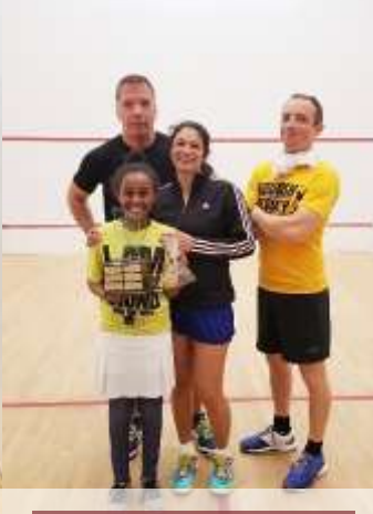
2018 STFT Champions!